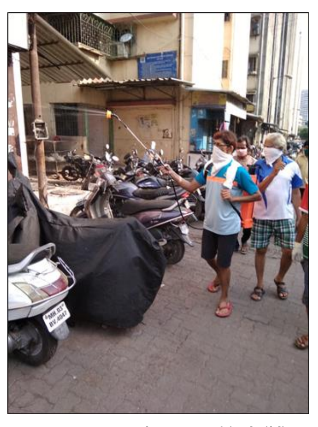
Volunteers sanitise buildings

One of the relocation colonies, Indian Oil which has more than 50 buildings was sanitized by Mahila Milan and the local community volunteers. While there was news about getting an additional 5kg ration to each ration card holder, the federation witnessed a complete different story where the ration officer did not receive any guidelines stating the above and noticed long queues outside the ration shops.